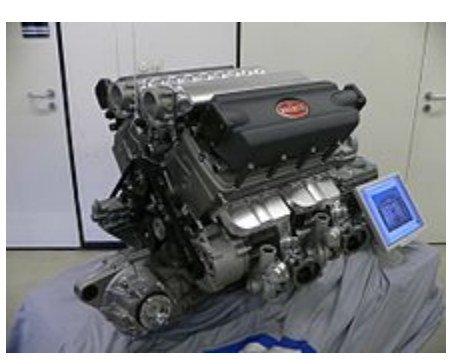
W16 petrol engine of the Bugatti Veyron

In most petrol engines, the fuel and air are usually premixed before compression (although some modern petrol engines now use cylinder-direct petrol injection). The premixing was formerly done in a <u>carburetor</u>, but now it is done by electronically controlled <u>fuel injection</u>, except in small engines where the cost/complication of electronics does not justify the added engine efficiency. The process differs from a <u>diesel engine</u> in the method of mixing the fuel and air, and in using spark plugs to initiate the